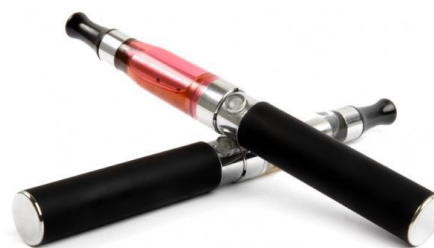
Example of an e-cigarette

Electronic cigarettes, also known as e-cigarettes, are becoming an emerging health concern. Contrary to popular belief, e-cigarettes are not an approved smoking cessation tool, although they have been marketed as such. These devices usually consist of a battery, a chamber to hold liquid, and a heating element. The liquid used to create aerosol contains nicotine, artificial flavoring, and other chemicals. Some of the chemicals known to be found in e-cigarette fluid are VOCs, such as formaldehyde. The FDA does not regulate e-cigarettes, therefore manufacturers are not required to provide information on what chemicals are used in their products, thus making it difficult to quantitatively assess their danger.