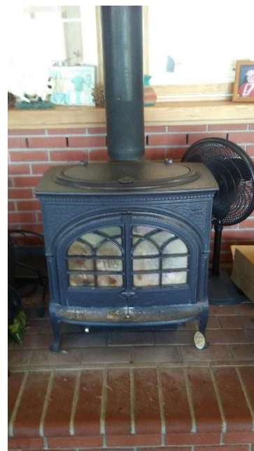
Woodstove at TBR Community Center

During the community presentation, we spoke to attendees about the importance of having a carbon monoxide detector in their homes, as well as regular maintenance of their stoves and furnaces. We informed the community that carbon monoxide detectors should be changed out every five years to ensure there is always a well-functioning detector in the home. During the four home visits and inspection of the administrative buildings, levels of carbon monoxide were either zero or very low. Also worthy of note, individuals that smoke commercial cigarettes and e-cigarettes also inhale carbon monoxide.