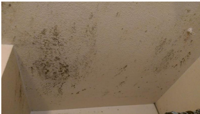
Mold on the roof of a TBR resident's home. Permission from homeowner was obtained to use this photo.

Mold can concentrate in areas inside the home that experience the most moisture, such as bathrooms. Another common place to find mold is under carpets, which can be much more inconspicuous. Cold surfaces, such as outside walls, can be an area where condensate forms and gravity pulls the droplets to the floor and creating an environment for mold growth. Anywhere in the home where condensate forms can be a potential breeding ground for mold. While mold can be detected visually most of the time, mold can grow in areas hidden from view. Hidden mold growth can make it difficult to detect and remediate. Often, a room will smell moldy or "stuffy," providing clues that there is mold growth. It is important to educate the community to look for