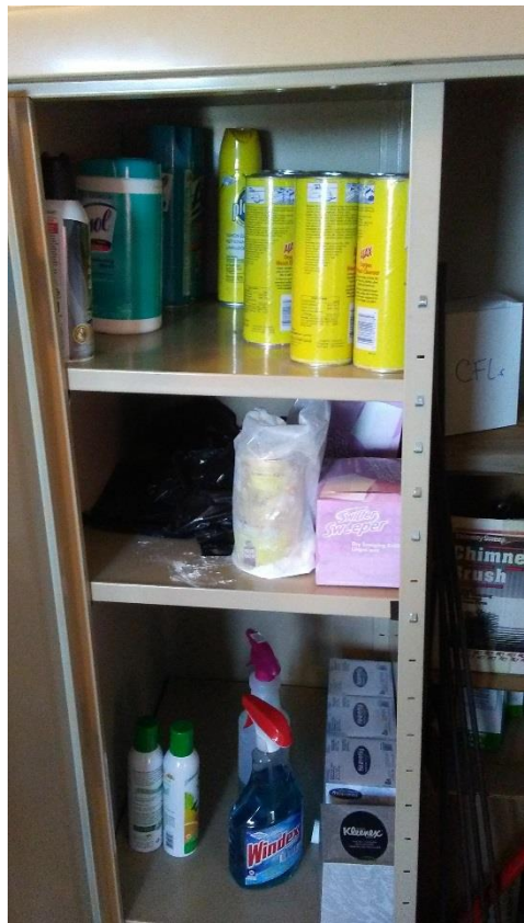
NRD building cabinet with several cleaning products.

Common household cleaners such as antibacterial sprays, wipes, air fresheners, and bleach often contain Volatile Organic Compounds (VOCs). These chemicals are defined by EPA as gases that are emitted by other solids or liquids. Using common household cleaners can expose a person to high levels of pollution, as VOCs inside the home can be over ten times more concentrated indoors than outdoors. Many chemicals in common household cleaning products contain allergens, carcinogens, and endocrine disrupting compounds.